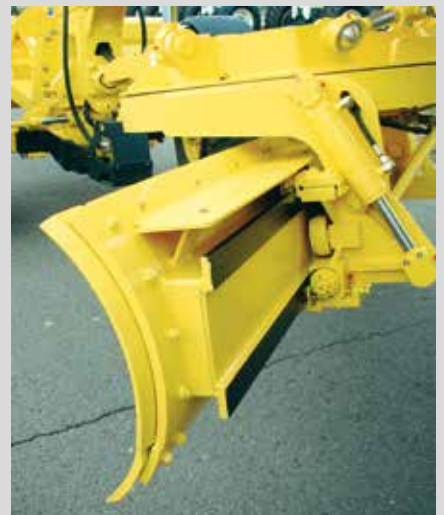
Infinitely adjustable hydraulic cutting angle adjustment.