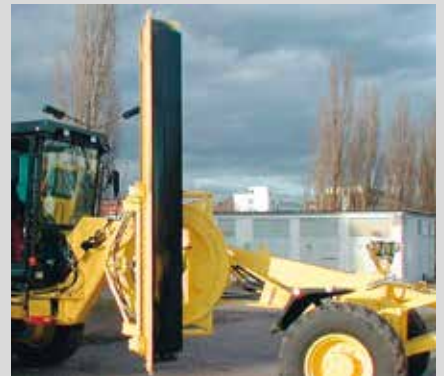
Closed turning circle available with roller bearings. Ground clearing angle 90° to the right and left.