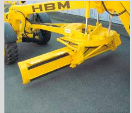
Sophisticated kinematics for rapid adjustment of the desired blade position.

Load sensing hydraulics and the adjustable steering control pedestal with ergonomic lever layout provide smooth and effortless control of all blade functions. The hydraulically operated moveable blade control system adjusts 90° vertically to the left and right of the machine giving the best blade range when grading for trenches or cutting embankments. The standard equipped overload clutch within the circle drive system protects the blade from damage caused by excessive impact loads during grading operations. The roller-bearing type circle is „playfree“ and ensures the highest degree of precision during fine-grading operations. Further advantages derive from the easy, smooth and fast rotation system with maximum torque transfer. Hydraulic blade tilt results in the optimum adaption of blade pitch to the rolling resistance of the material. The grader's blade range is both horizontally and vertically adjustable and all blade guide rails are manufactured from special Hardox wear-resistant steel. Automatic differential locks on drive axles. On all-wheel drive models inter-axle locks between front and rear axles provide optimum blade pull. Optimum power transfer and blade pull is further maximised by external planetary gears in all wheels.