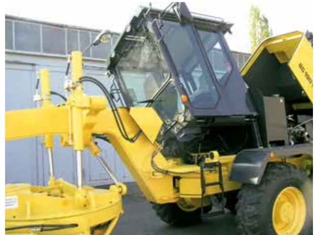
Good maintenance accessibility: Cab and engine cover tiltable.