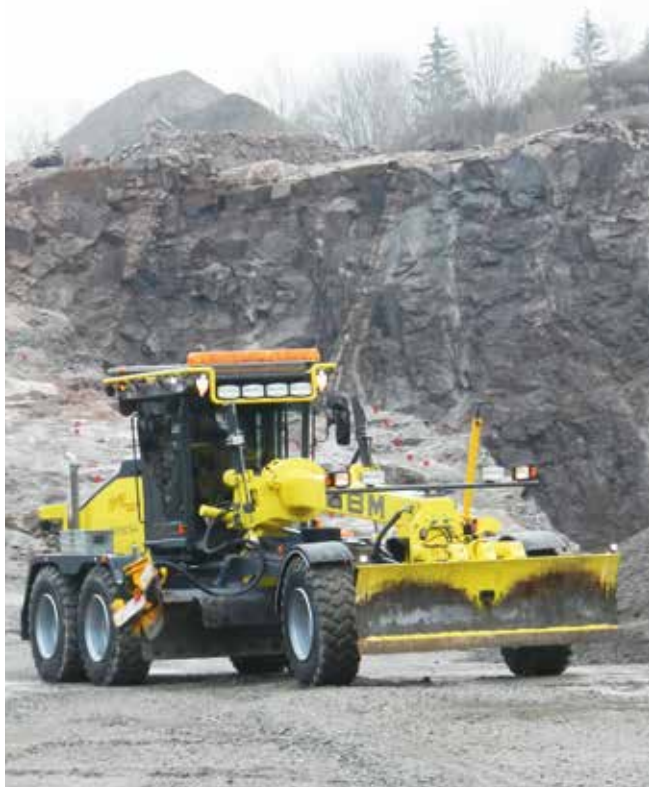
BG 190, all-wheel drive, heavy-duty operation in stone quarry

With four different weight classes and the choice between tandem and all-wheel drive: HBM offers a versatile range for every purpose. The BG 110 grader is ideal for the confined inner-city site, cycle tracks and sports facilities as well as for gardening and landscaping. The medium duty three-axle grader BG 160 is the universal choice for road building. Powerful and at the same time a very mobile unit; the BG 160 grader performs the most different tasks. The large three-axle graders BG 190 and BG 240 are the powerhouses for handling heavy-duty applications, such as airfield and motorway construction, open pit mining and forestry operation. An extensive range of accessories and additional fittings also means that different and individual requirements can also be handled with the best possible results.