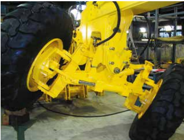
Driven front axle with wheel lean.