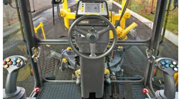
Good visibility to all sides – joystick, EURO, or arrangement of rods available.