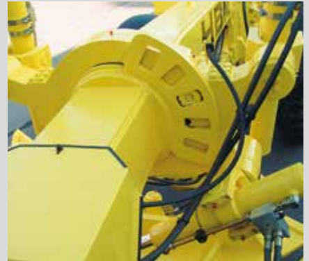
Adjustable turning bridge for embankment and trench work.